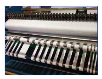
cold blade slitting machine