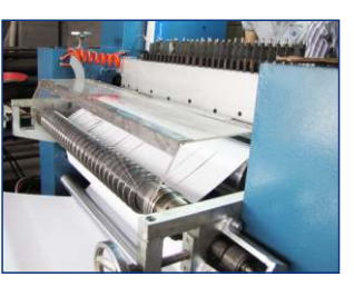
Heating And Cool Blade Slitting Machine